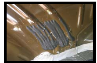
Photos from a 2011 Ford Mustang showing the sound deadener beads placed from the manufacturer in the trunk area.

These suggestions and data are based on information we believe to be reliable and accurate, but no guarantee of their accuracy is made. International Epoxies & Sealers shall not be liable for any damage, loss or injury, direct or consequential arising out of the use or the inability to use the product. In every case, we urge and recommend that purchasers, before using any product in full scale production, make their own tests to determine whether the product is of satisfactory quality and suitability for their operations, and the user assumes all risk and liability whatsoever, in connection therewith.